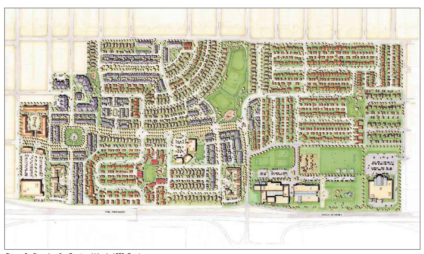
Figure 5: Site plan for Garrison Woods (CFB East)

Architect: Dan Jenkins, Jenkins & Associates Landscape Architect: Jim Laidlaw, IBI Group