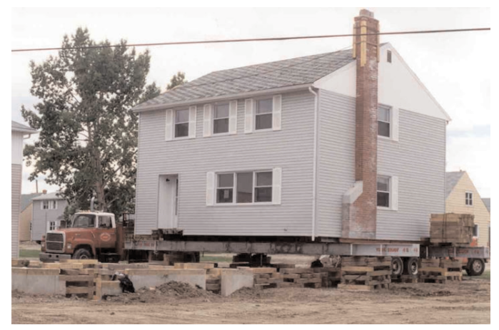
Figure 4: Hundreds of the old houses on the military base were refurbished and relocated at increased densities.

The homeowners were happy with a smaller house with a back yard because they felt it was affordable for young families and couples looking to get started on their own. One apartment owner felt that the sizable patio gave more private outdoor space than expected and a nice view into the building courtyard.