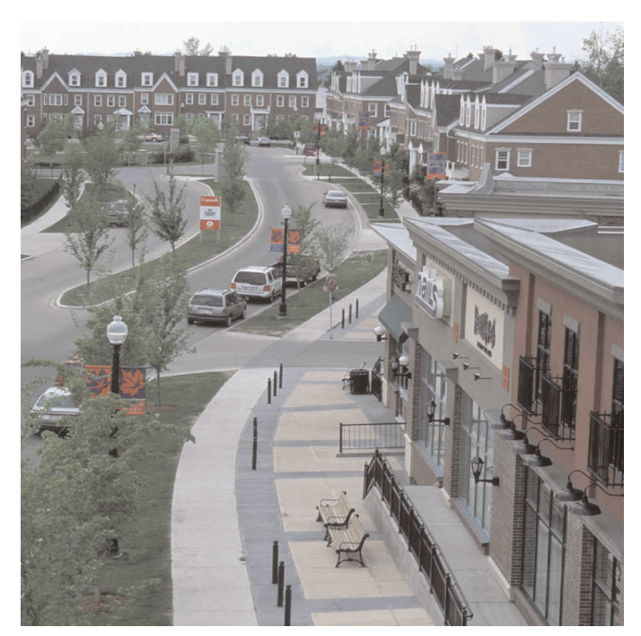
Figure 2: Commercial corner at Garrison Woods showing customized road standards