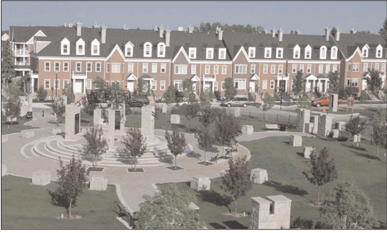
Figure 1: Garrison Woods: townhouses look onto the neighbourhood square

Canadian Forces Base (CFB), with 565 low-density housing units for military personnel